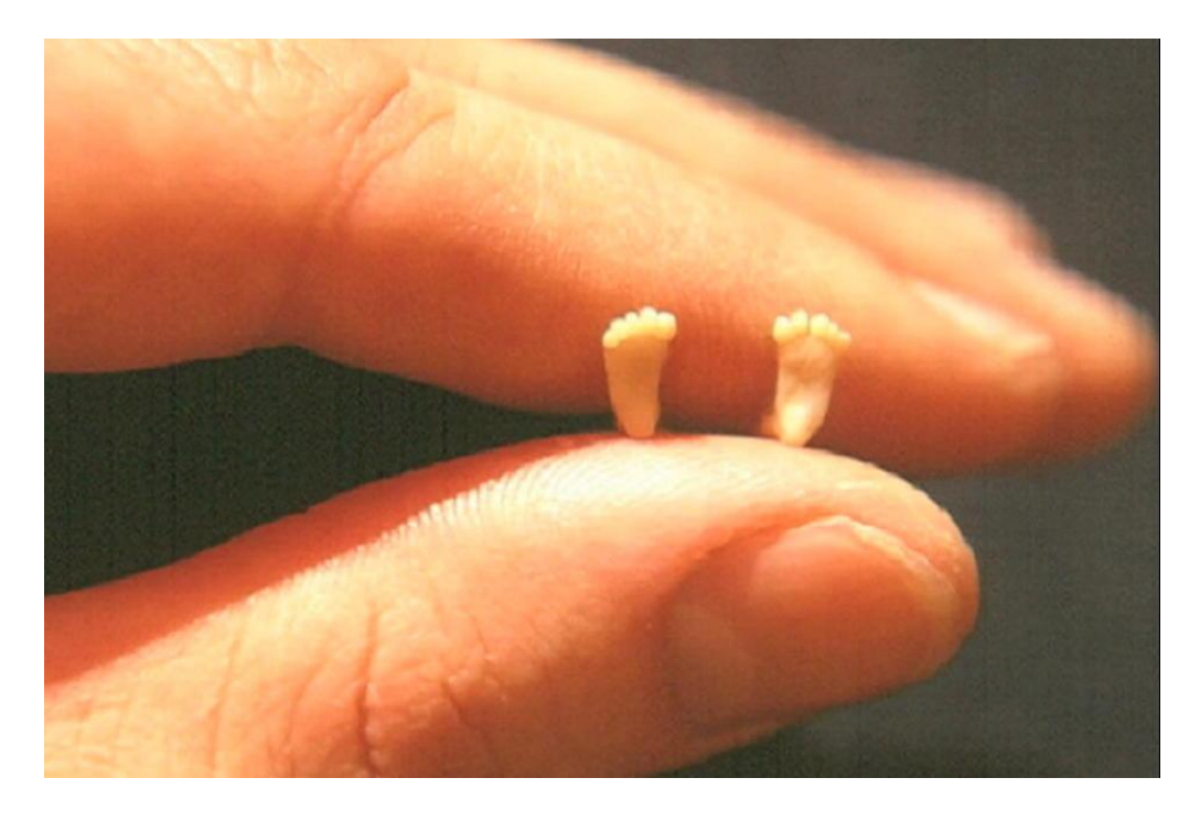
Photo by Dr. Sacco of an approximately 10 week after conception preborn child's feet