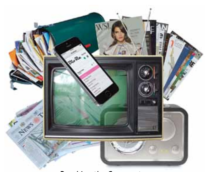
Reaching the Grassroots

Getting a two-thirds majority of the federal legislature to pass the Life Amendment is the first challenge to the Amendment program. In order to accomplish this, our entire nation must be made aware that an amendment is being sought. This information necessarily comes from America's media. This includes newspapers, magazines, radio, TV, and the internet media sources. This looks overwhelming, but it is possible by starting with a determination to succeed.