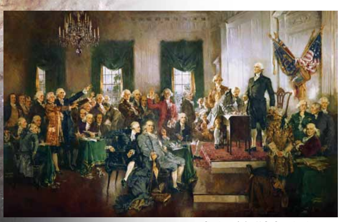
Signing of the U.S. Constitution

The Executive Branch consists of the president, the vice president, and a number of secretaries who have special areas of concern. The Legislative Branch is comprised of two bodies, or houses, namely the