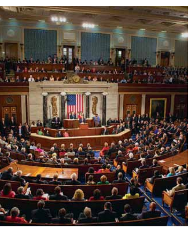
Joint Session of Congress

tures, or 38 states, must pass, or ratify, the amendment by a simple majority vote. At this point, the proposed amendment becomes an official part of the Constitution.