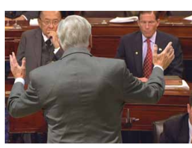
Introducing an Amendment

The essence of the Proclamation is recognizing the unborn human being as a person throughout pregnancy. When so recognized, existing Amendments 5 and 14 will protect the life of the unborn child. Amendment 5 says "No person shall be deprived of life without due process of the laws," and Amendment 14 says "No state shall deprive any person of life without due process of the laws." Crusade for Life's proposed amendment offers the text