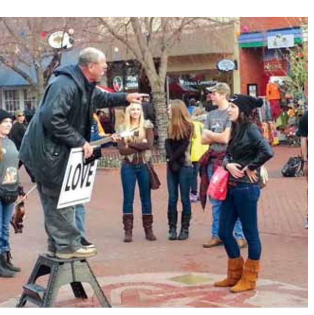
Freedom of Speech

Once a Constitutional amendment has been enacted, it becomes a permanent part of the Constitu-